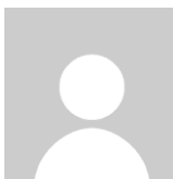
Vacant, Dean of Students Affairs